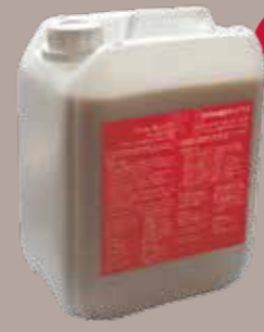
Designflooring Refresh 5 litres 90m 2