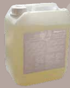
Designflooring Remove 5 litres 250m 2