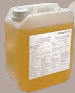
Designflooring Clean 5 litres 1250m 2

Make sure you use 'Wet Floor' signs to indicate the area being cleaned throughout the cleaning process.